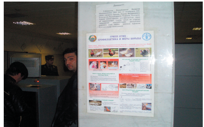
The following posters were developed by Uzbek Veterinary Department to prevent a spread of bird flu in private households of Uzbekistan.