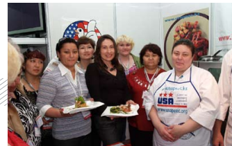
В рамках предыдущей выставки HORECA Совет США по Экспорту Мясa Птицы и Яиц организовал и провел Второй Кулинарный Конгресс CUISINE VIRTUOSO, на котором лучшие повара г. Алматы готовили великолепные блюда из куриных окорочков.

Добро пожаловать на стенд USAPEEC выставки WorldFood Kazakhstan 2009! 3 - 6 ноября Выставочный Центр «Атакент» (г. Алматы, Казахстан). Стенд USAPEEC №12 будет расположен в Павильоне «11».